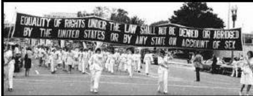
The Alice Paul Memorial March, Washington, D.C. 1977.