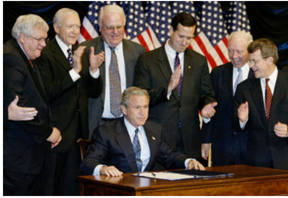
Bush and his white, male cronies cheer as they sign away our reproductive rights.